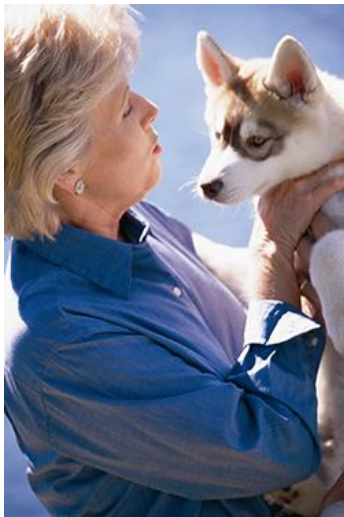
Table or people foods are not usually recommended for pets. Because they are usually very tasty, dogs will often begin to refuse their well-balanced dog food in favor of table food. If you choose to give your puppy table food, be sure that at least ninety percent of its diet is from a quality commercial puppy food. If not, follow a properly formulated recipe that has been developed by a formally trained veterinary nutritionist.

Each of the types of food has advantages and disadvantages. Dry food is definitely the most inexpensive. It can be left in the dog's bowl without spoilage for longer periods of time than canned or moist foods. Semi-moist foods may be acceptable, depending on their quality. The texture may be more appealing to some dogs, and they often have a stronger odor and flavor. However, semi-moist foods are often high in sugar and calories and should be carefully chosen based on their nutritional qualities rather than taste, packaging or consistency. Canned foods are a good choice to feed your dog, but are considerably more expensive than either of the other forms of food. Canned foods contain a high percentage of water, and their texture, odor, and taste are very appealing. However, canned food will dry out or spoil if left out for prolonged periods of time. Canned food is generally more suitable for meal feeding rather than free choice feeding.